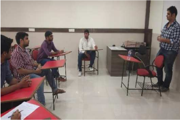
Part-time students enjoying a day of Sports as a part of Teaching-Learning Activity